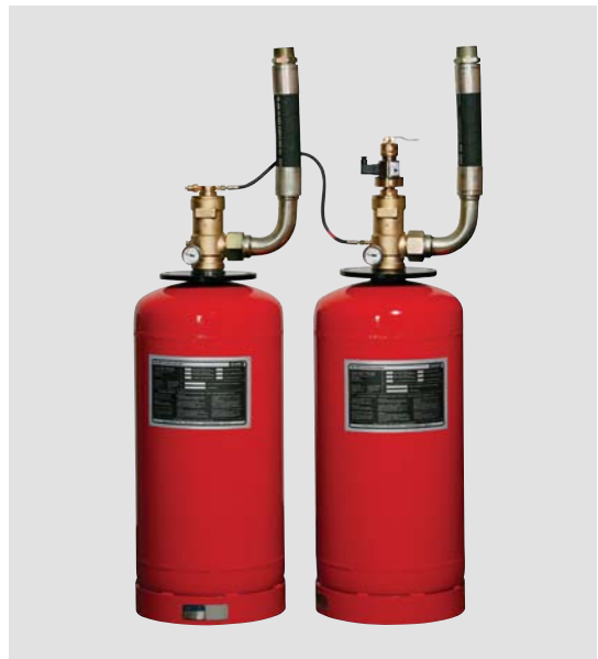
Example of a multi-cylinder system

What you're looking for: system types from A to Z